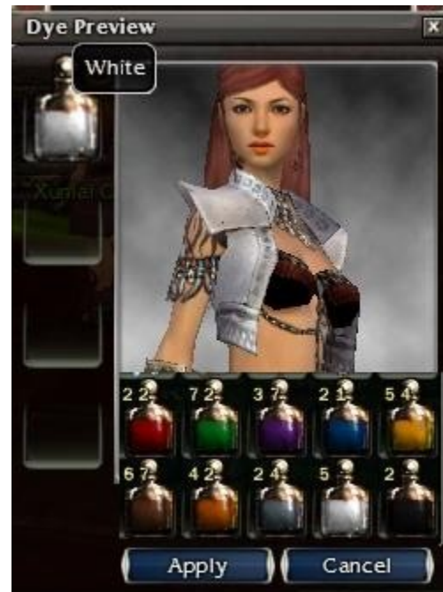
Edited Guild Wars Screenshot: Dye Preview and all dyes

The price of the Dyes fluctuate. So if selling to the Dye merchant at times, the prices will be higher or lower though out the day.